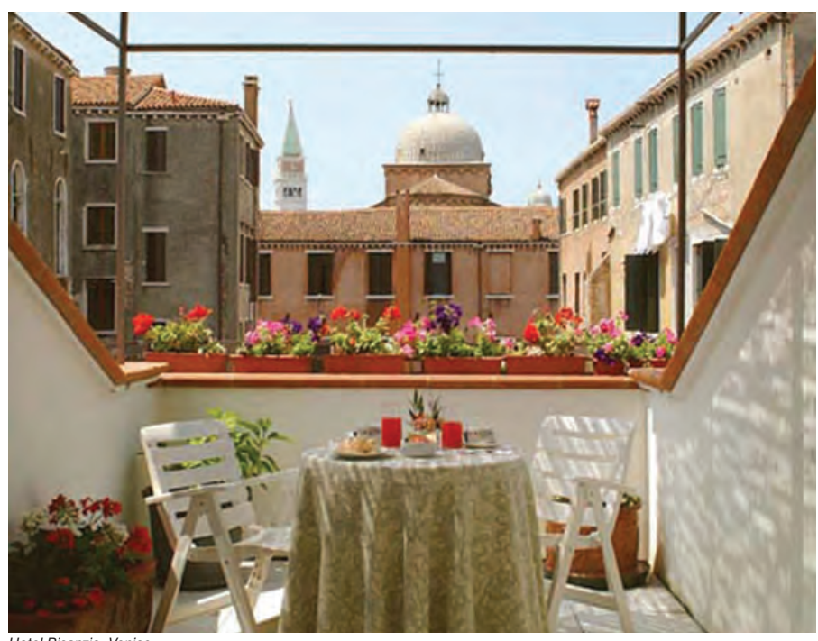
Hotel Bisanzio, Venice

Ca'Sagredo Venice sits majestically on the banks of the Grand Canal in Venice. With only 42 rooms and suites, the grand public areas of Ca'Sagredo make up a large proportion of the hotel and include marble staircases and beautiful frescoed halls. The elegant guest rooms at Ca'Sagredo are each unique and combine traditional Venetian decoration with some contemporary touches. Enjoy Venetian cuisine and local wines while whilst overlooking the Grand Canal from the panoramic terrace at the L'Alcova Restaurant or a drink in L'Incontro, the atmospheric bar. The Ca'Sagredo hotel is just a short walk away from St Mark's Square, the main museums and the best fashion boutiques.