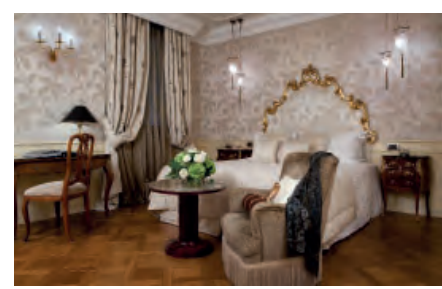
Baglioni Hotel Luna, Venice